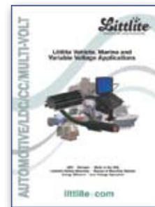
Automotive, LDC/CC/ Multivolt 28-1034