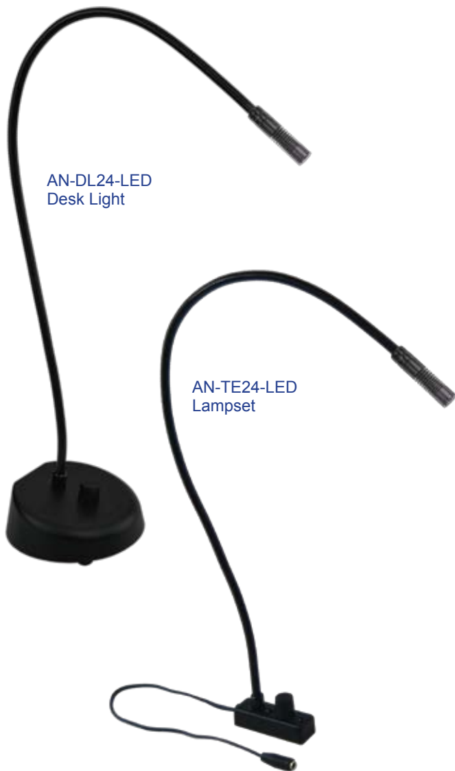
AN-DL24-LED Desk Light