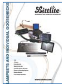
Lampset, Individual & Specialty Lite Catalog 28-1017D

For other 2014 catalogs available see below. Contact sales@littlite.com to order your copy.