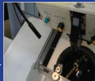
Assembly Light ▶

*USB operation subject to available current at USB port.