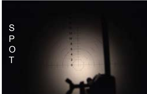
S P O T

In addition to our standard models, the ANSER is available in a “Spot” version featuring a focused light output. The ANSER Spot series concentrates the light in a tighter pattern minimizing spill when used in close lighting applications.