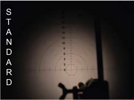
S T A N D A R D